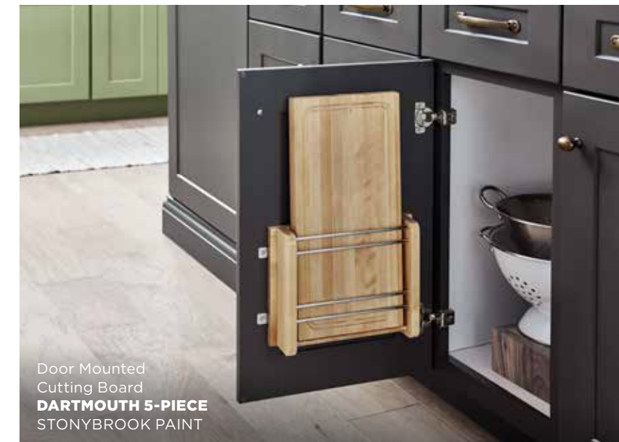
Door Mounted Cutting Board DARTMOUTH 5-PIECE STONYBROOK PAINT