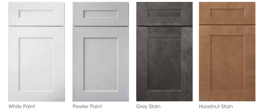
White Paint Pewter Paint Grey Stain Hazelnut Stain

The popular and contemporary Dartmouth style offers a little added flair with 5-piece drawer fronts. Available in two different stains and two popular paints, these doors and drawers are sure to bring class and distinction to any room in your home.