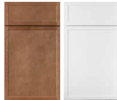
Hazelnut Stain White Paint