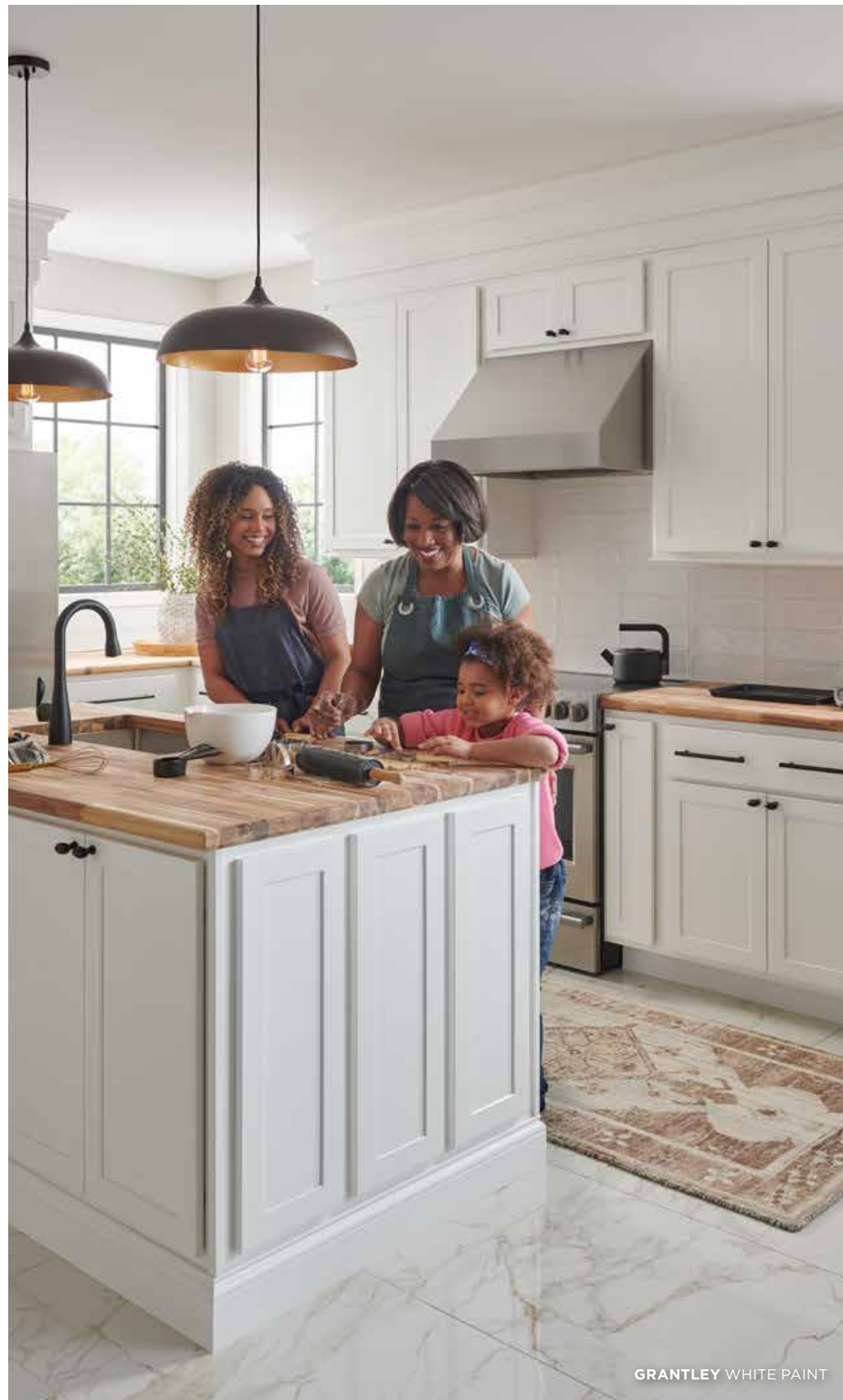
GRANTLEY WHITE PAINT