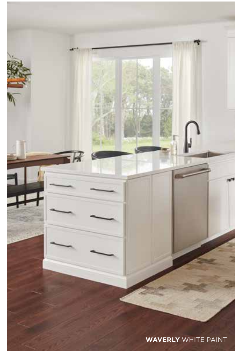
WAVERLY WHITE PAINT