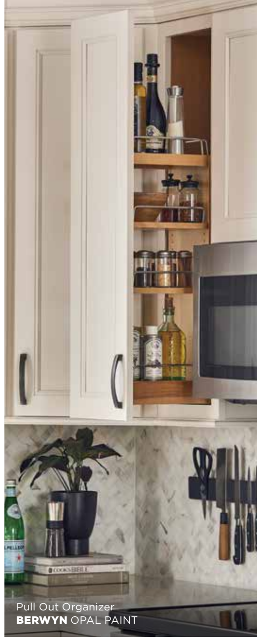
Pull Out Organizer BERWYN OPAL PAINT