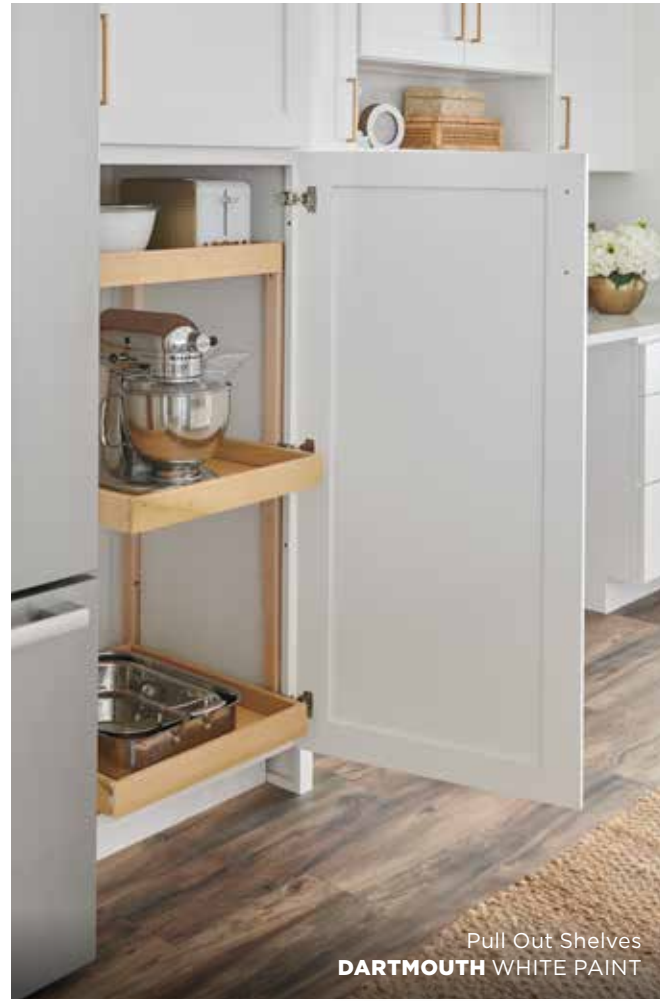
Pull Out Shelves DARTMOUTH WHITE PAINT