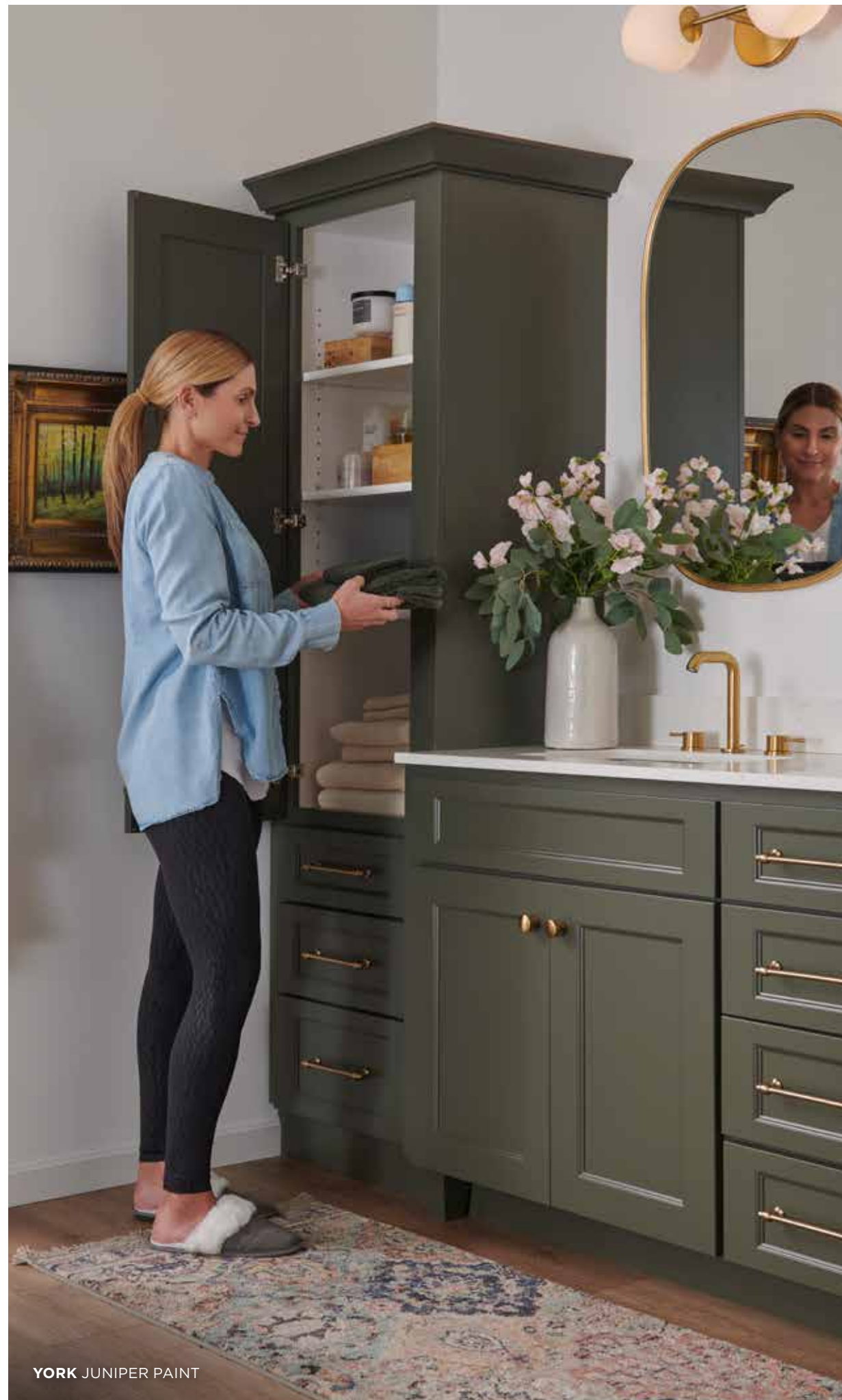
YORK JUNIPER PAINT