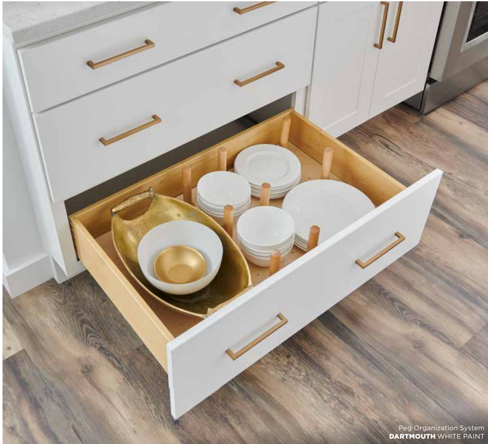
Peg Organization System DARTMOUTH WHITE PAINT