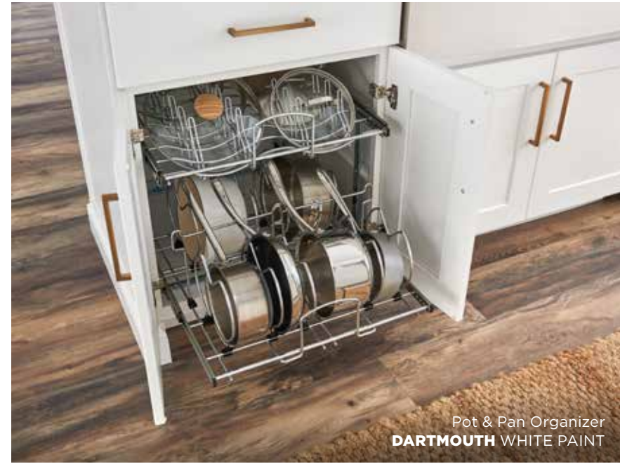
Pot & Pan Organizer DARTMOUTH WHITE PAINT