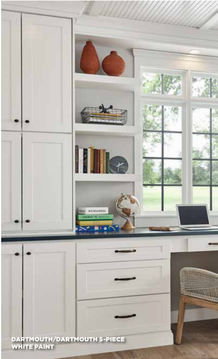
DARTMOUTH/DARTMOUTH 5-PIECE WHITE PAINT