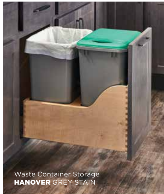
Waste Container Storage HANOVER GREY STAIN