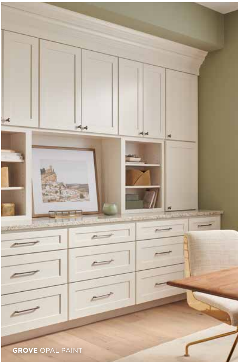
GROVE OPAL PAINT