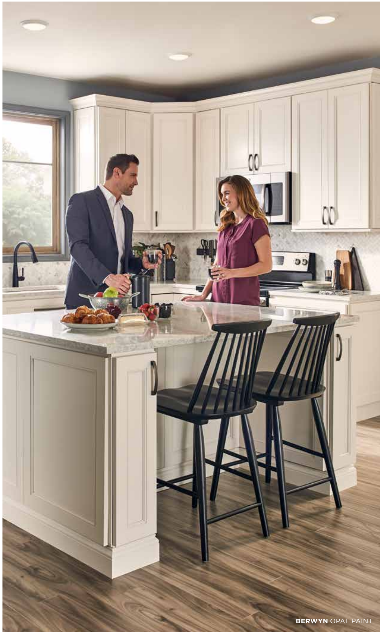
BERWYN OPAL PAINT