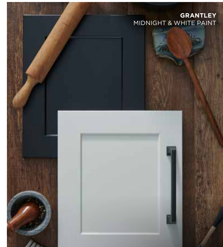
GRANTLEY MIDNIGHT & WHITE PAINT