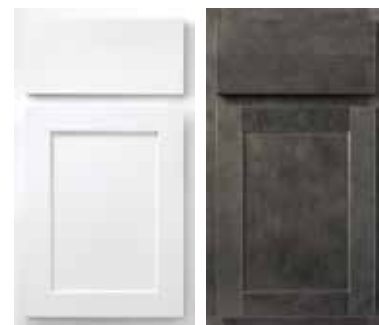
White Paint Grey Stain