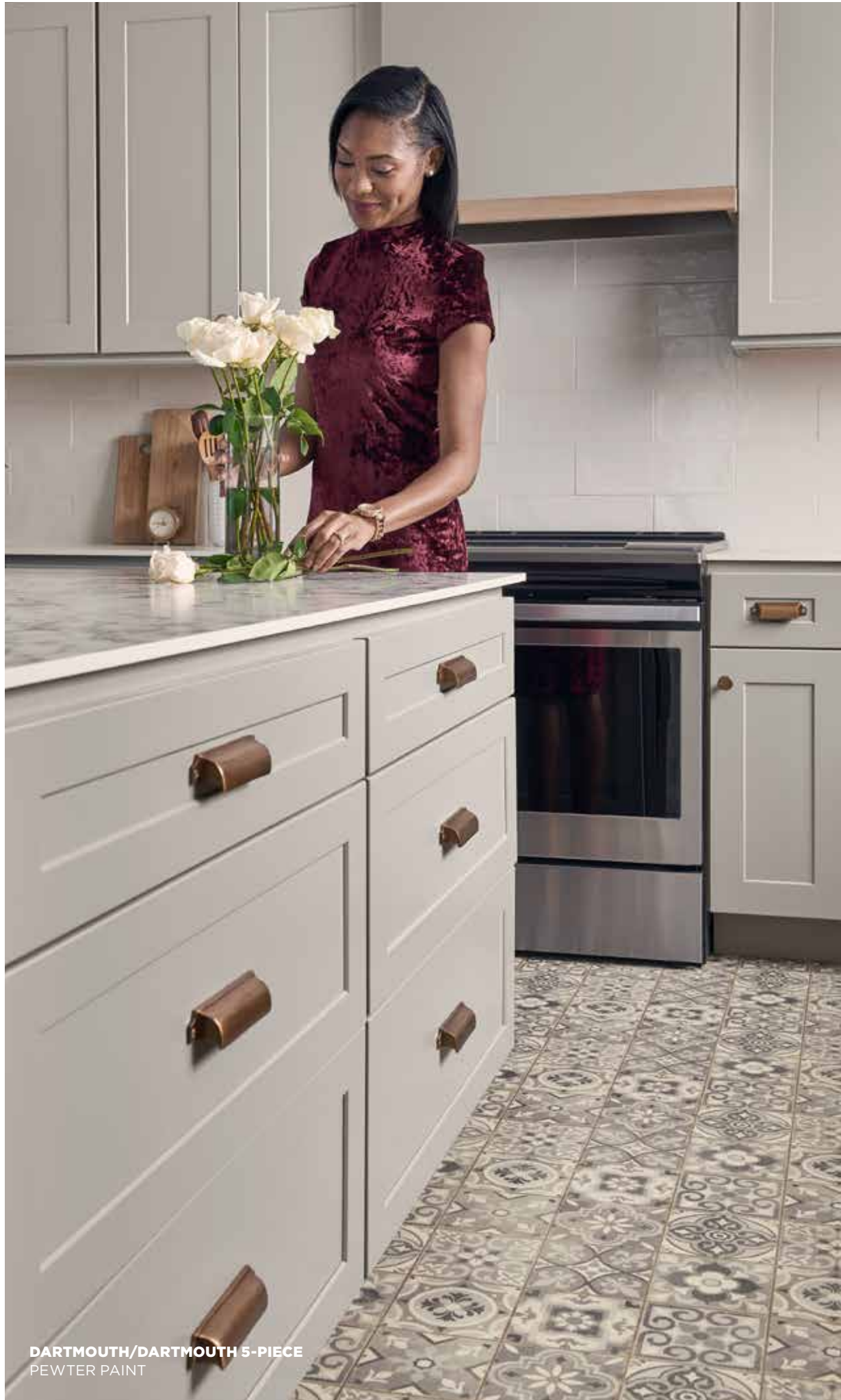
DARTMOUTH/DARTMOUTH 5-PIECE PEWTER PAINT