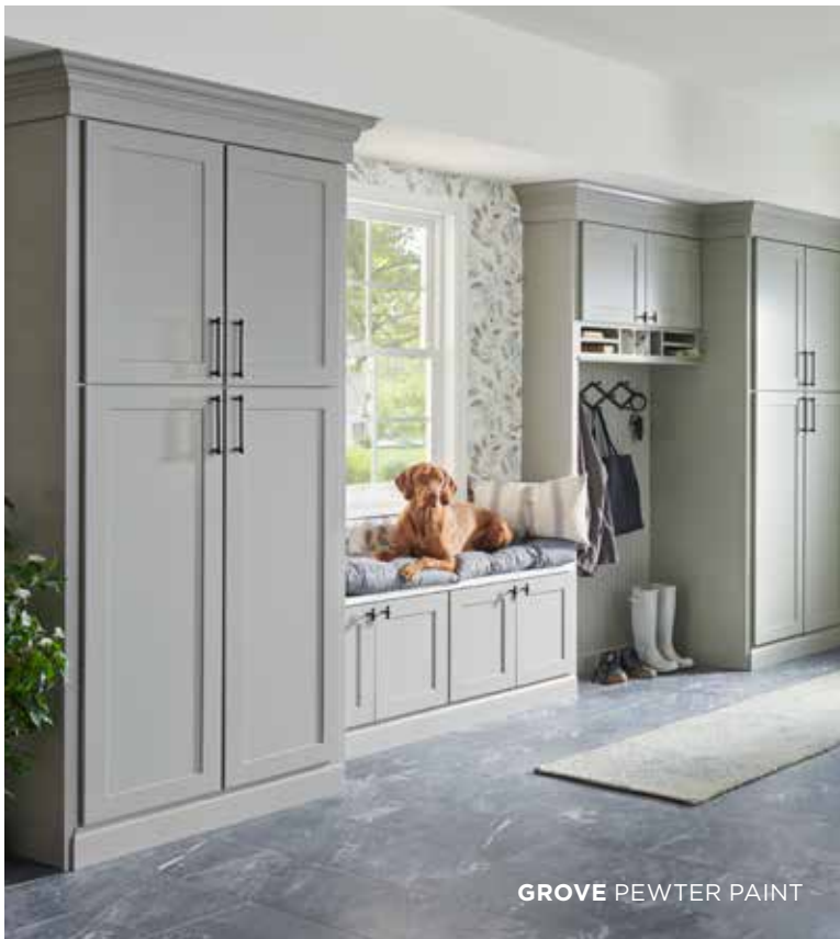
GROVE PEWTER PAINT