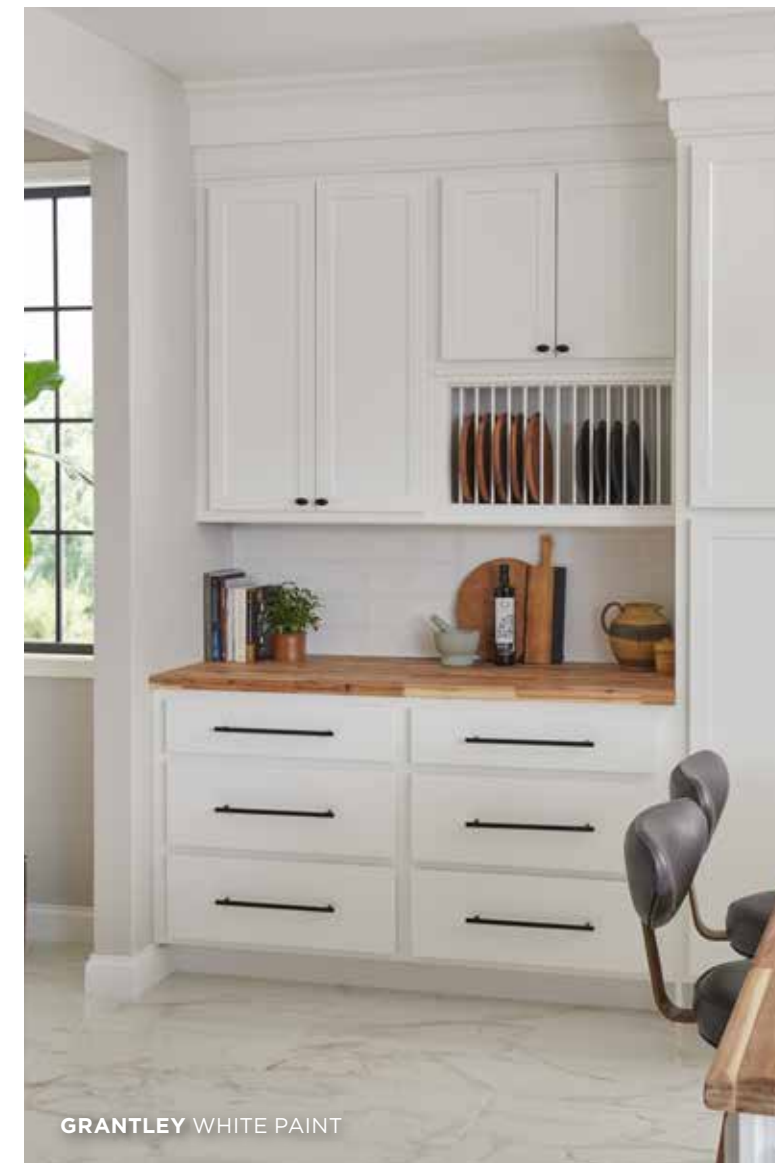
GRANTLEY WHITE PAINT