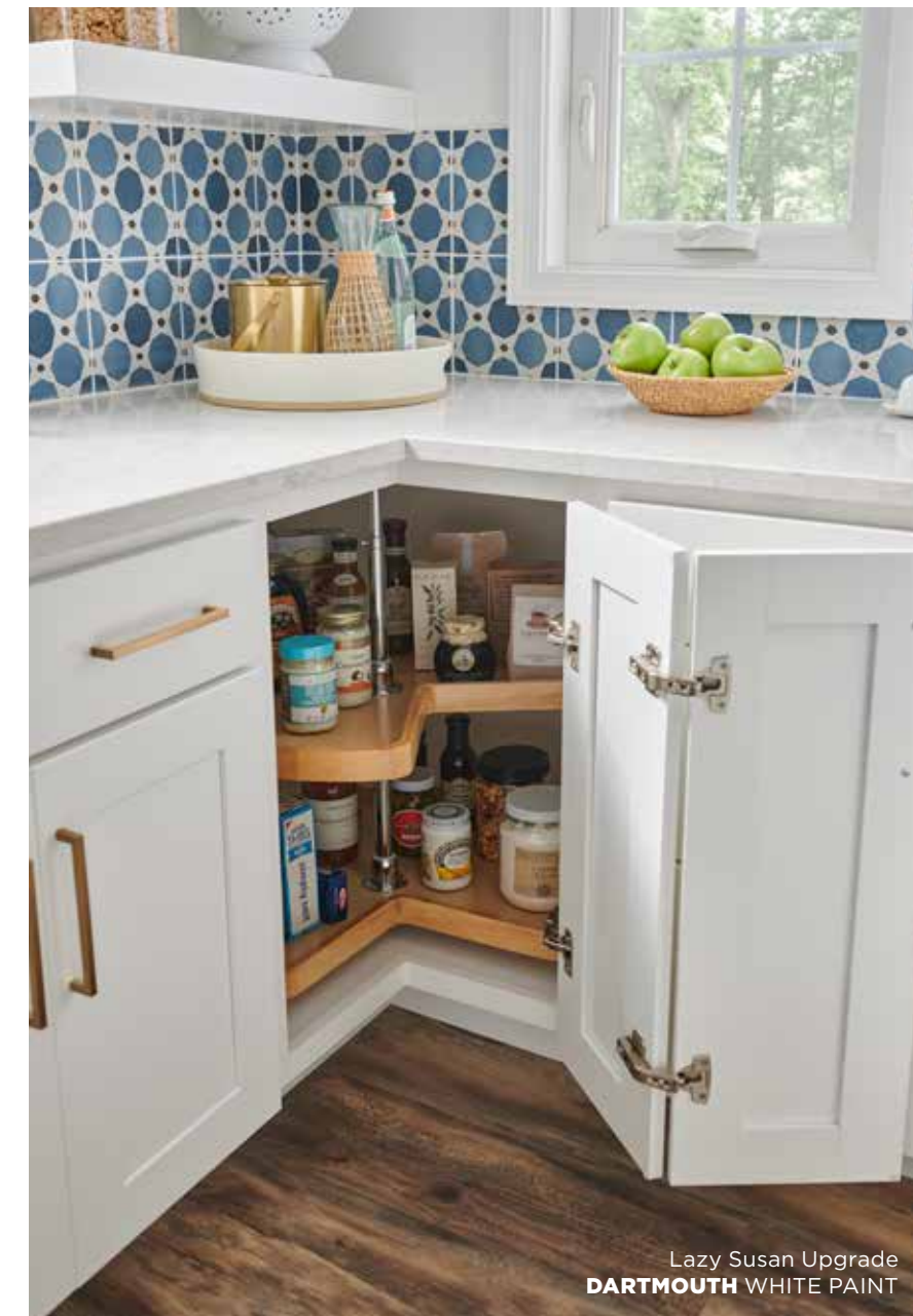
Lazy Susan Upgrade DARTMOUTH WHITE PAINT