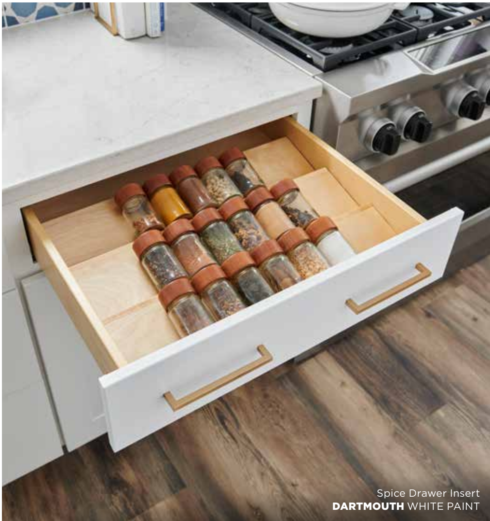
Spice Drawer Insert DARTMOUTH WHITE PAINT