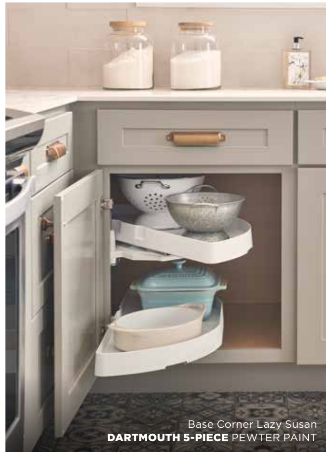
Base Corner Lazy Susan DARTMOUTH 5-PIECE PEWTER PAINT