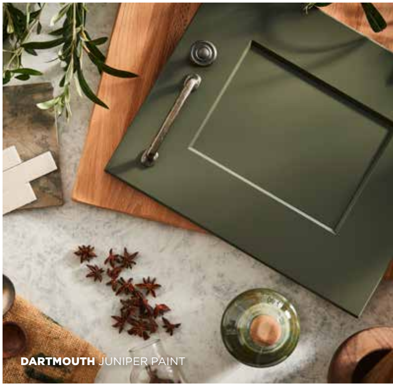
DARTMOUTH JUNIPER PAINT