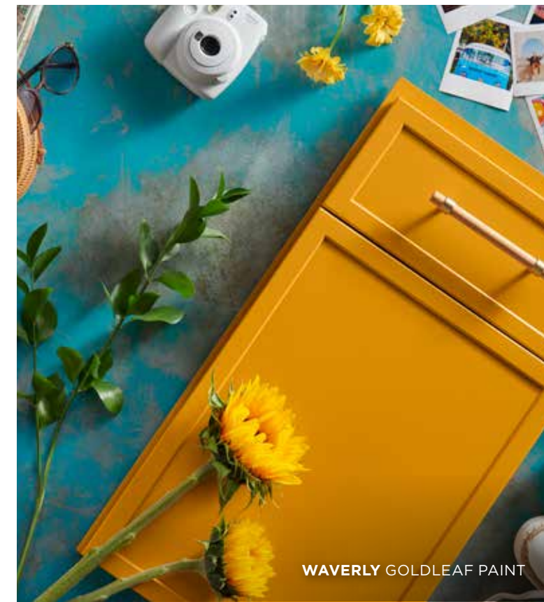
WAVERLY GOLDLEAF PAINT