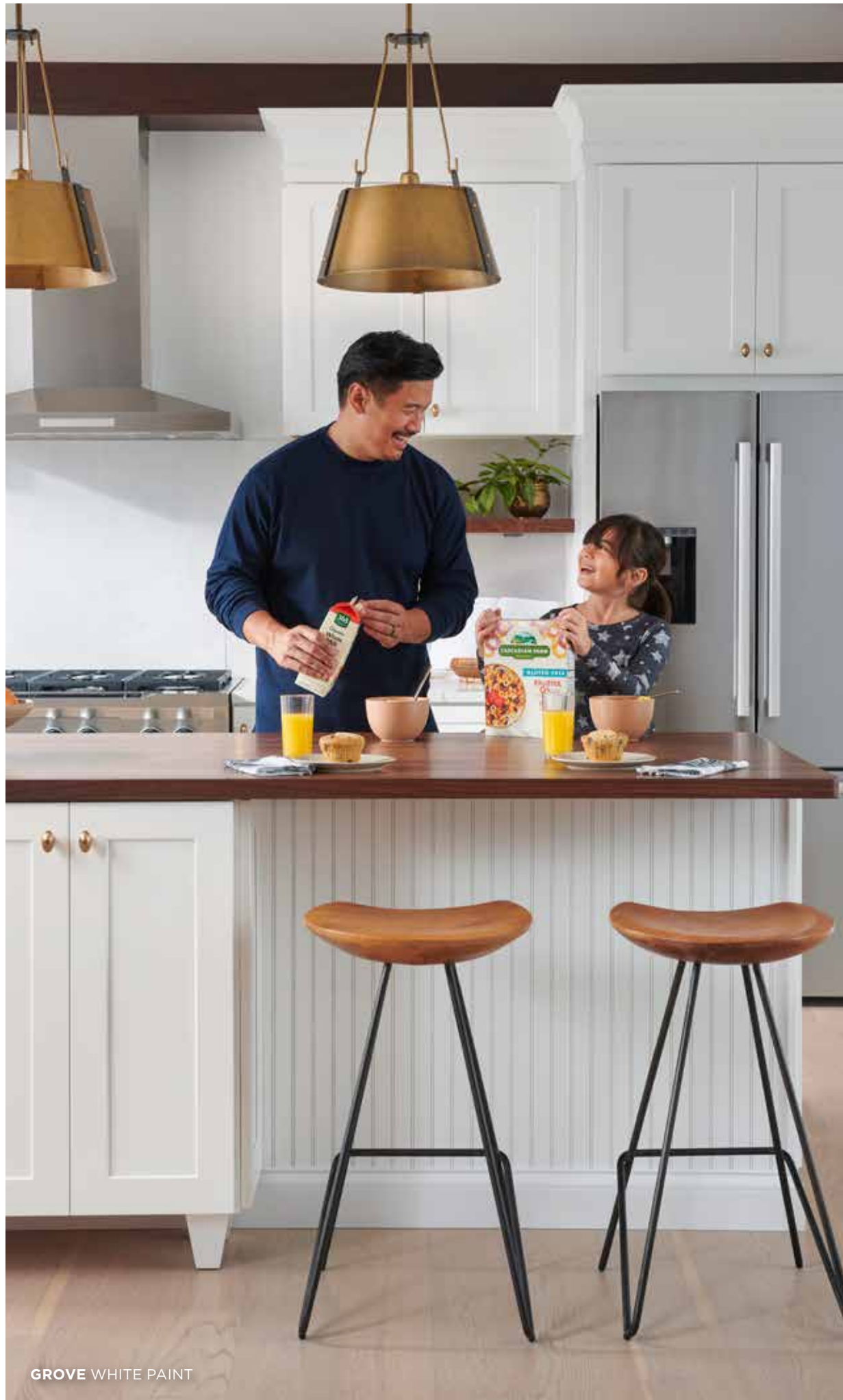
GROVE WHITE PAINT