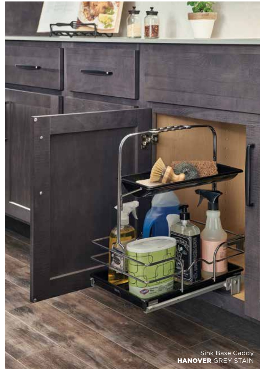
Sink Base Caddy HANOVER GREY STAIN