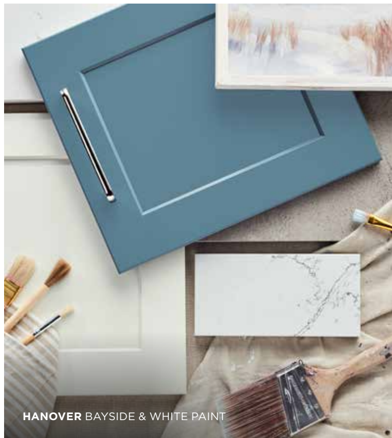
HANOVER BAYSIDE & WHITE PAINT