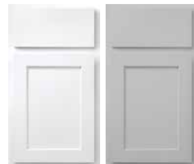
White Paint Pewter Paint