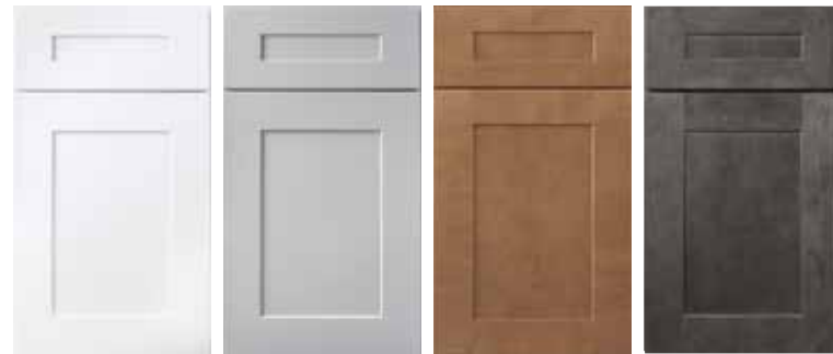
White Paint Pewter Paint Hazelnut Stain Grey Stain