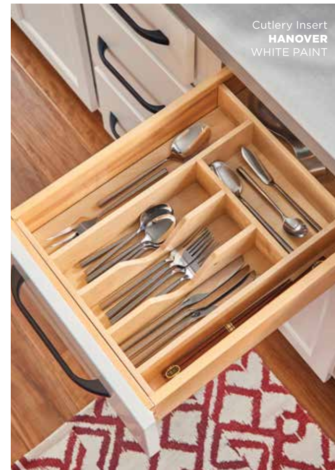
Cutlery Insert HANOVER WHITE PAINT

When designing Wolf Classic cabinets, we had both form and function in mind. From food storage to recycling, these simple solutions will make your space work hard for you.