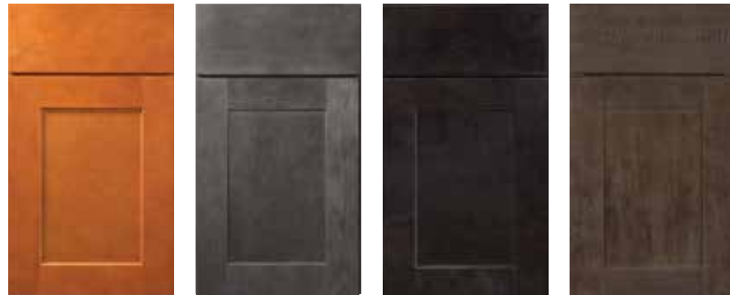
Honey Stain Grey Stain Dark Sable Stain Brownstone Stain

A blank slate can be a wonderful thing. With our Dartmouth cabinets, you can give any space a clean, contemporary look. Modern Shaker-style doors make the perfect canvas for your hardware and accessory choices. Available in five different stains and two popular paints, Dartmouth cabinets are as adaptable as they are good-looking.