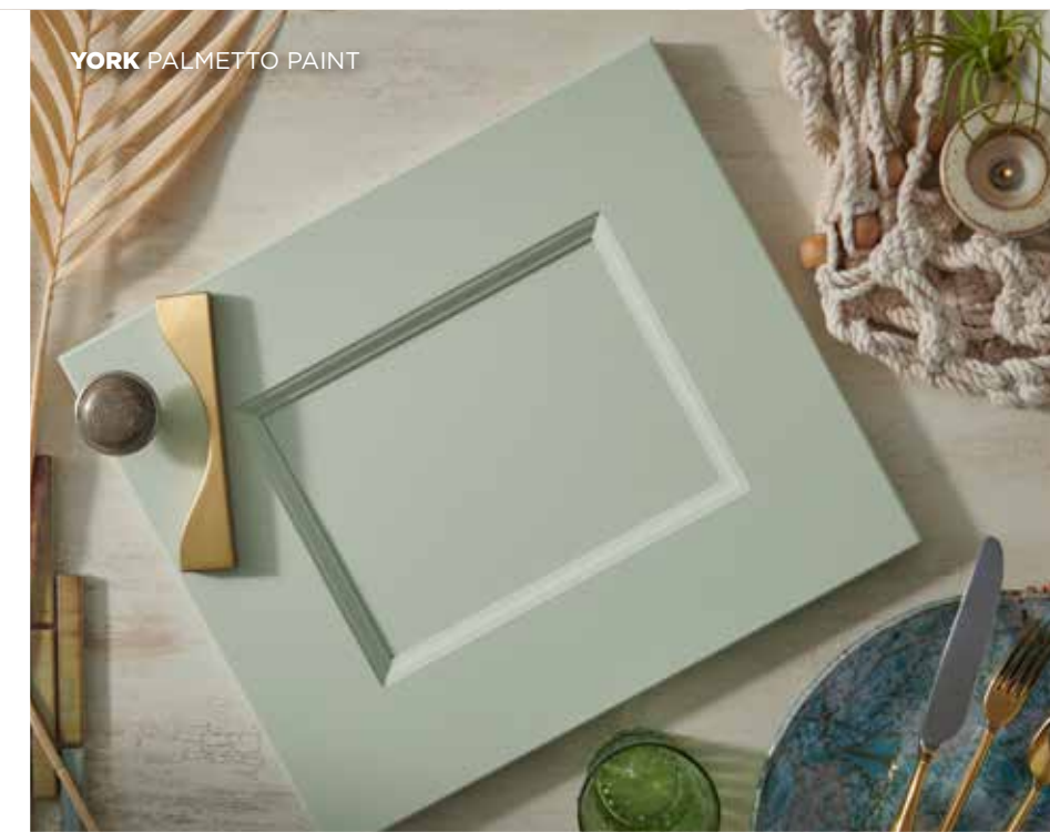
YORK PALMETTO PAINT