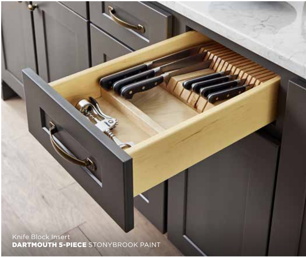
Knife Block Insert DARTMOUTH 5-PIECE STONYBROOK PAINT