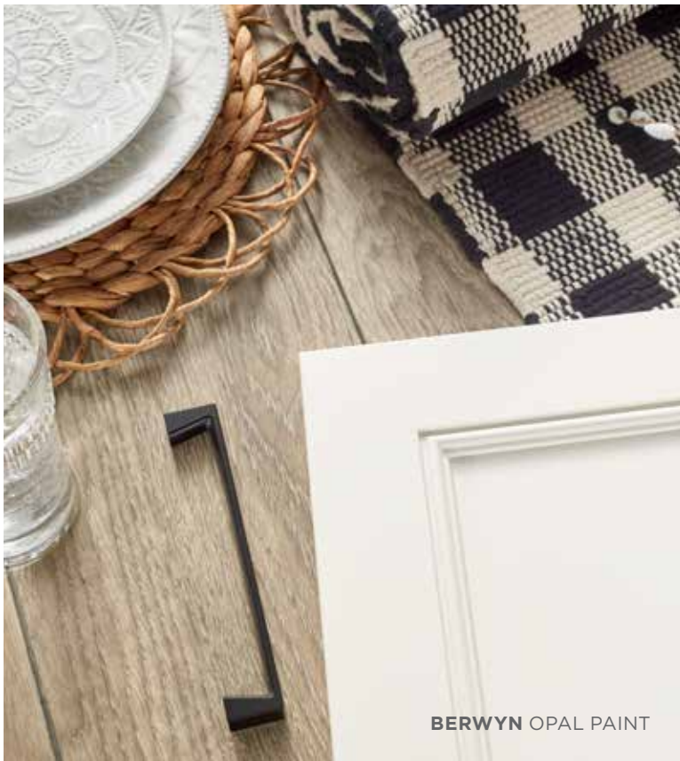
BERWYN OPAL PAINT