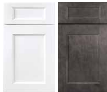
White Paint Grey Stain