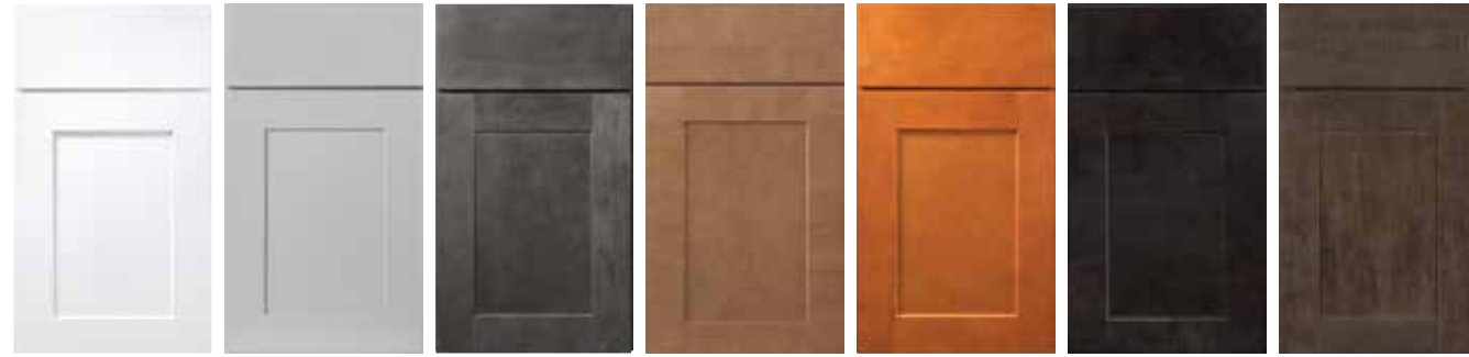
White Paint Pewter Paint Grey Stain Hazelnut Stain Honey Stain Dark Sable Stain Brownstone Stain