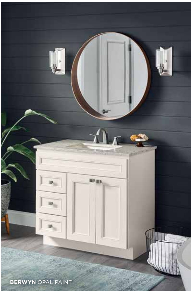
BERWYN OPAL PAINT