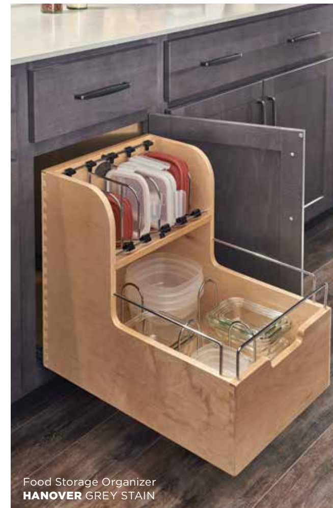
Food Storage Organizer HANOVER GREY STAIN