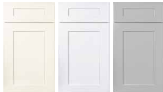
Opal Paint White Paint Pewter Paint (coming soon)