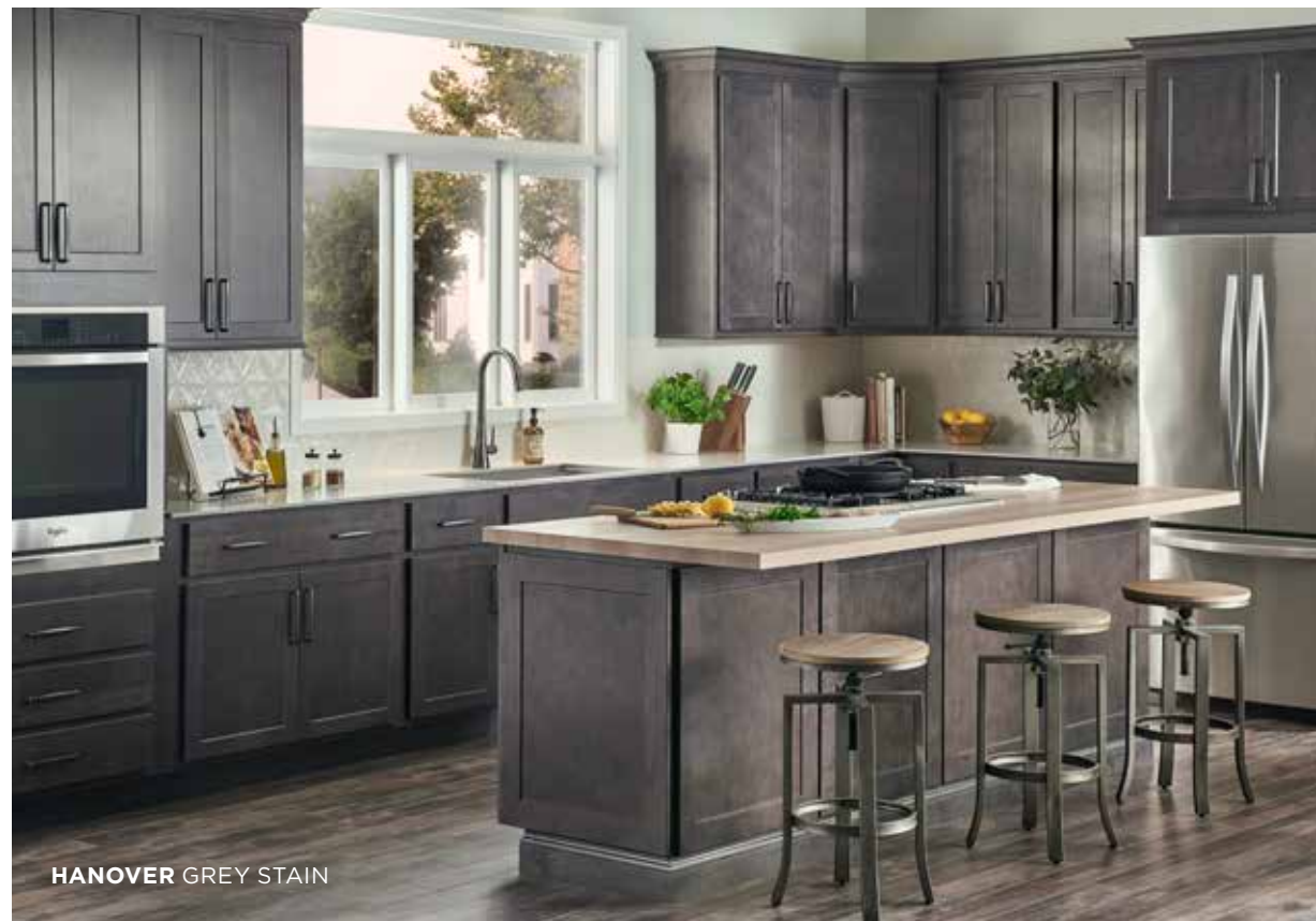
HANOVER GREY STAIN