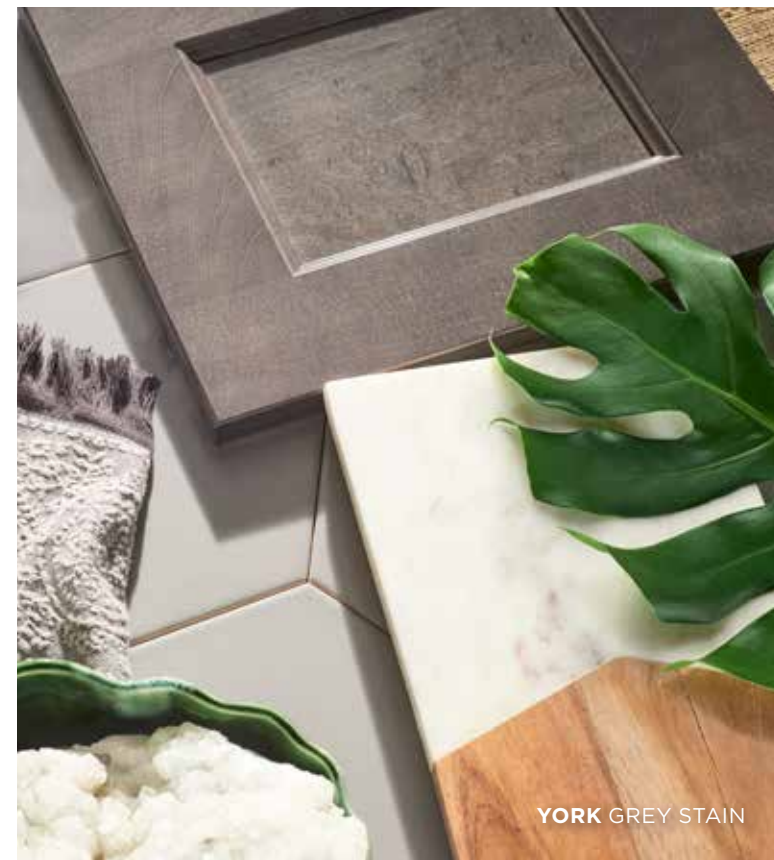
YORK GREY STAIN