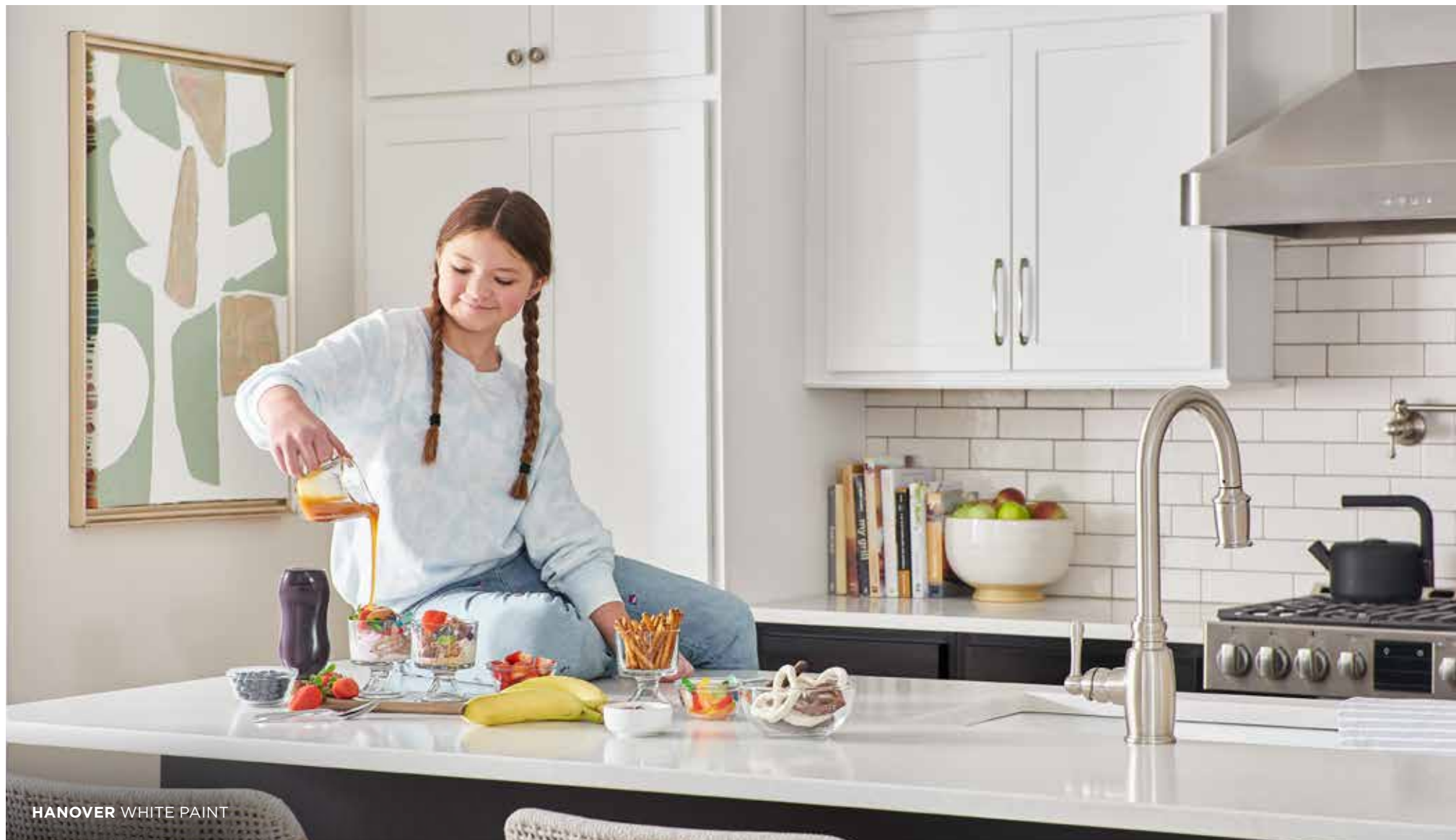
HANOVER WHITE PAINT