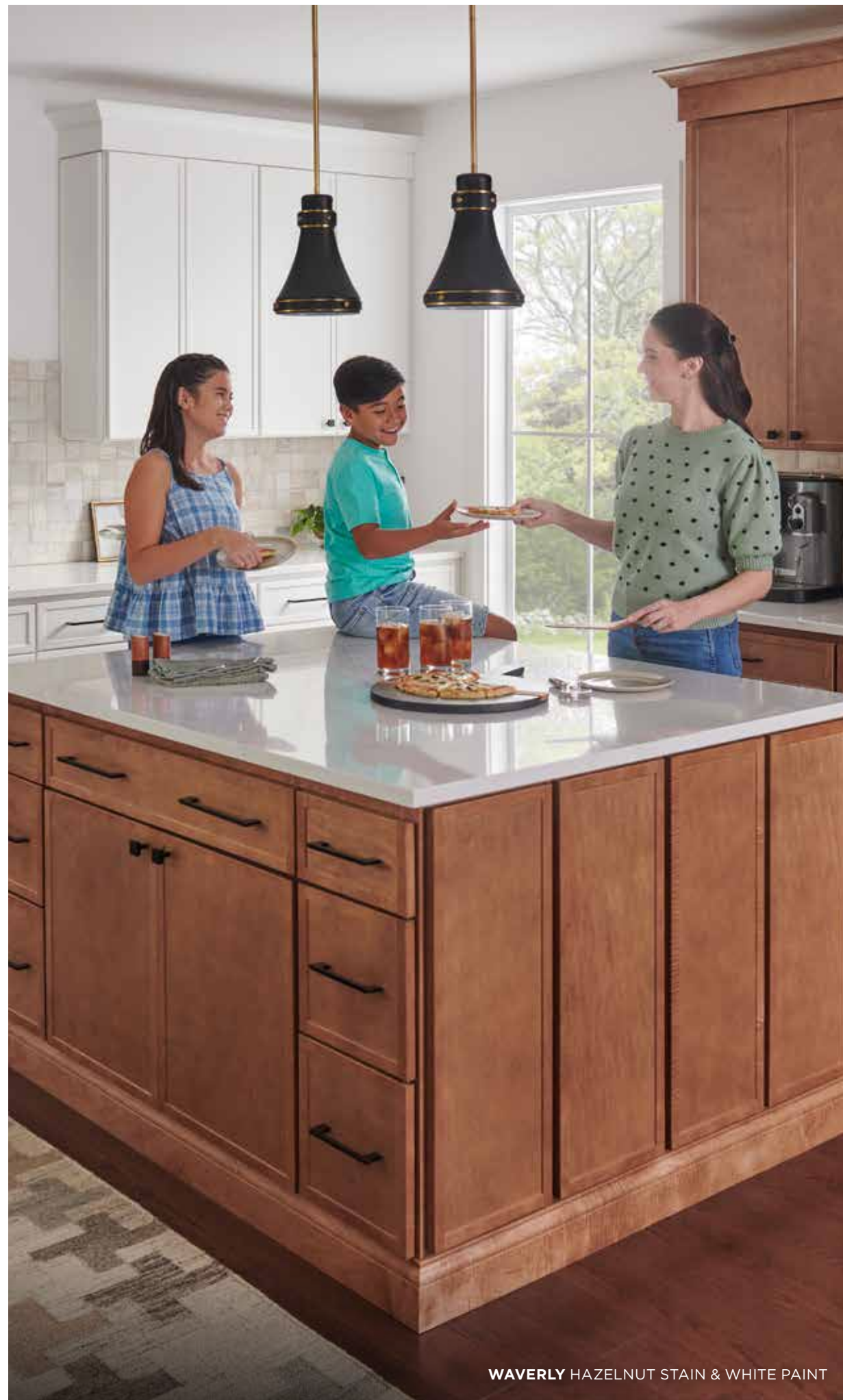
WAVERLY HAZELNUT STAIN & WHITE PAINT