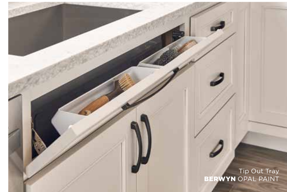
Tip Out Tray BERWYN OPAL PAINT