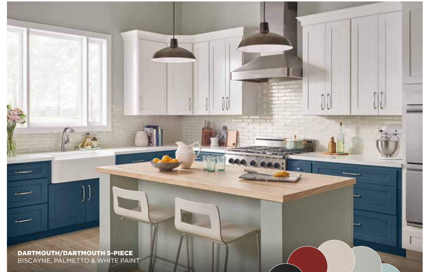
DARTMOUTH/DARTMOUTH 5-PIECE BISCAYNE, PALMETTO & WHITE PAINT