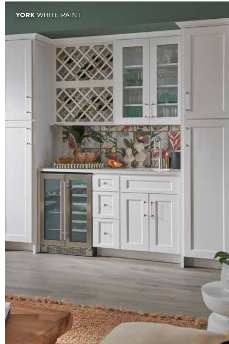
YORK WHITE PAINT